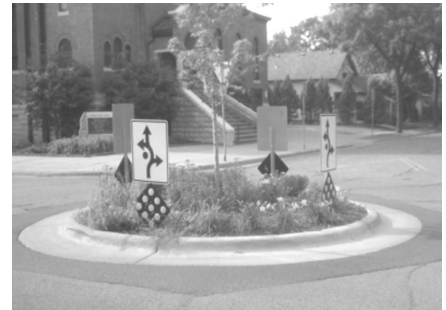
Example traffic circle