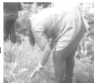
Volunteer pulling onions