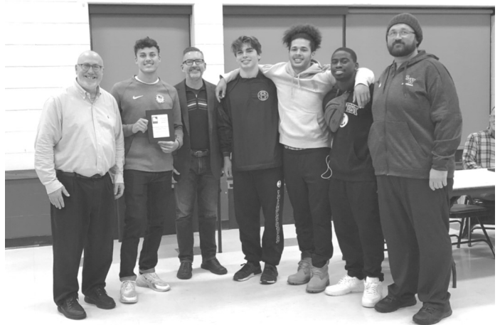
Southwest High School Football Team

Please visit the FNA website ( fultonneighborhood.org ) for more details on all of our recipients and their good work in the neighborhood.